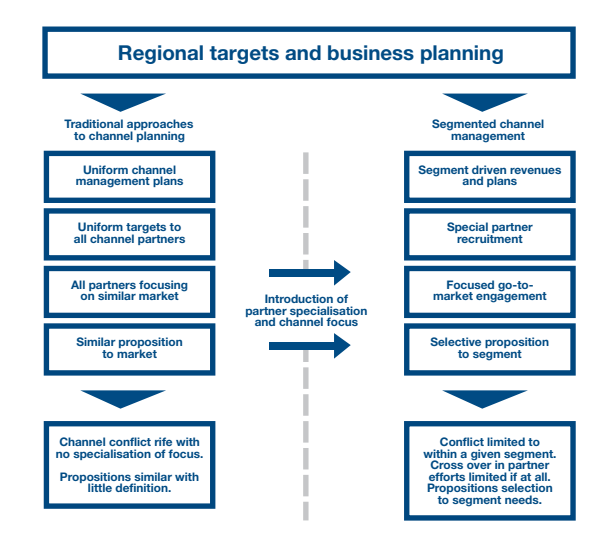
Fig2 Using segmentation, partners are divided and targeted upon given sectors to focus effort, revenue stream planning and performance.

Having segmented the channel base it is now possible to weight targets according to sector or focus. This simple programme of isolation and target setting increases partner enthusiasm and improves confidence to achieve targets and agreed plans.